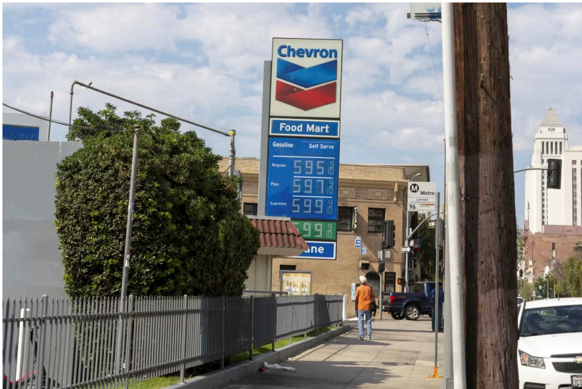
US oil major Chevron is planning a $600m soyabean joint venture with crops processor Bunge